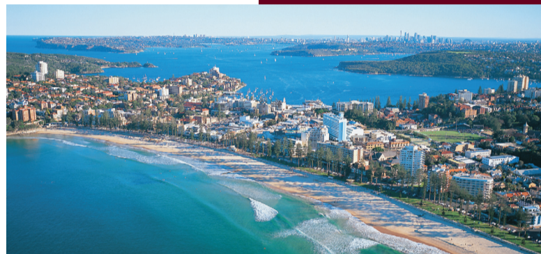
Manly to the City (Manly Council)