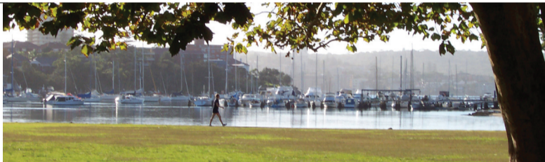
Manly Scenic Walkway at North Harbour Reserve (Manly Council)